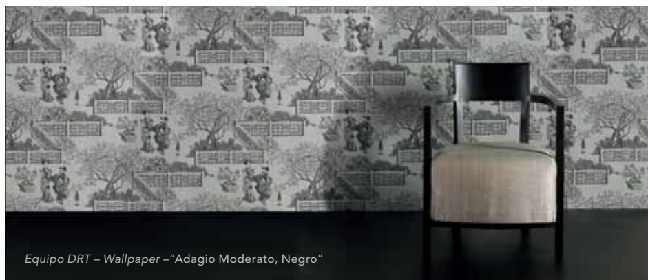
Equipo DRT – Wallpaper – “Adagio Moderato, Negro”

T.R. Hamzah & Yeang | (60 3) 4257 1966 | trhamzahyeang.com